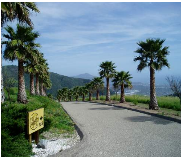
Driveway leading to the property