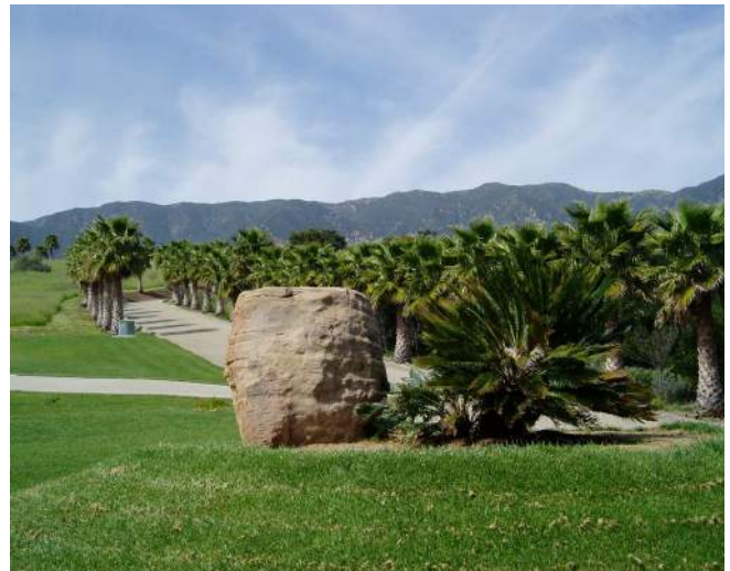
Driveway leading to the property