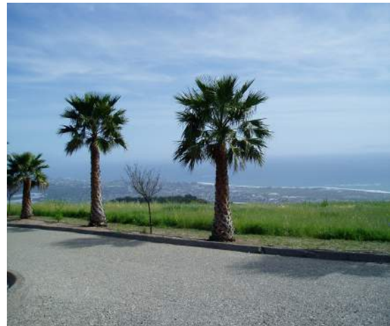
Driveway leading to the property