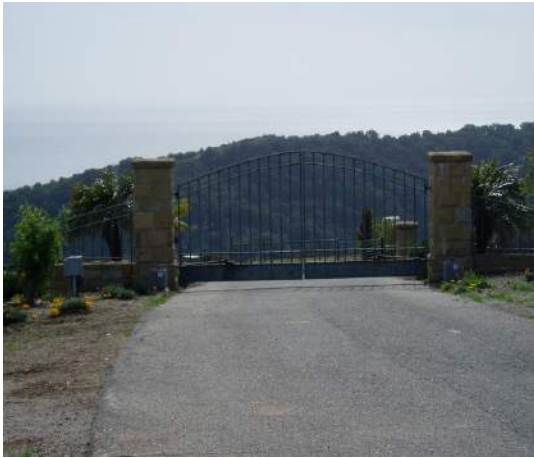
Gate leading to the property

This area is popular with some celebrities. For example, previous owner of this property was Richard Widmark before the Short Land Company bought it. Arnold Schwarzenegger's ex-wife, Maria Shriver, recently bought neighboring land.